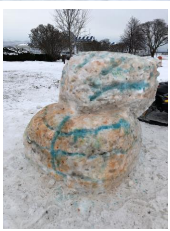
MCPS FEB/MARCH 2020