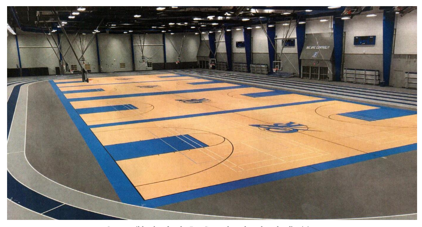
One possible plan for the Rec Center based on the school's vision.

The recreation center offers a large enough space that we could schedule all practices without conflicts and get our student athletes home much earlier every evening. With this goal in mind, we have engaged the Village in a conversation about the recreation center.