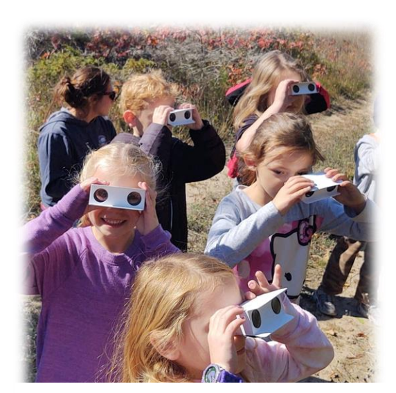
The First grade class spent some time at the Hathaway Property last month learning about animals and their habitats.